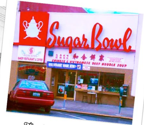
The first Sugar Bowl storefront