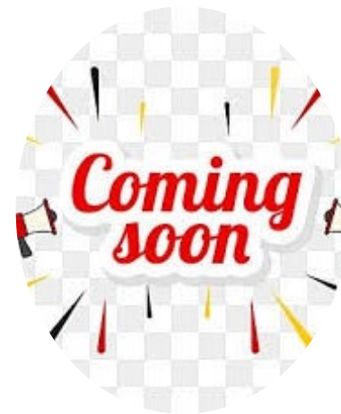
Vacant Upstate Region