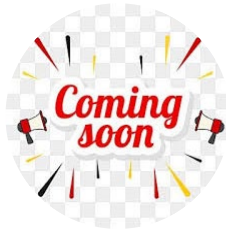
Vacant Trident Region